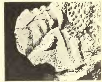
5 x 3